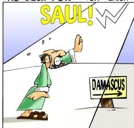
and .. Saul is stopped by the first TRAFFIC LIGHT on the road to Damascus. Acts 9:1-6 3rd degree 'SON'burn as Jesus speaks to Saul through the light.