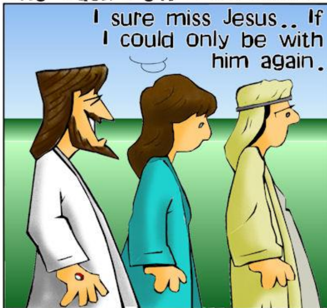
Jesus takes a post resurrection stroll 'incognito' on the road to Emmaus. Luke 24:13-35