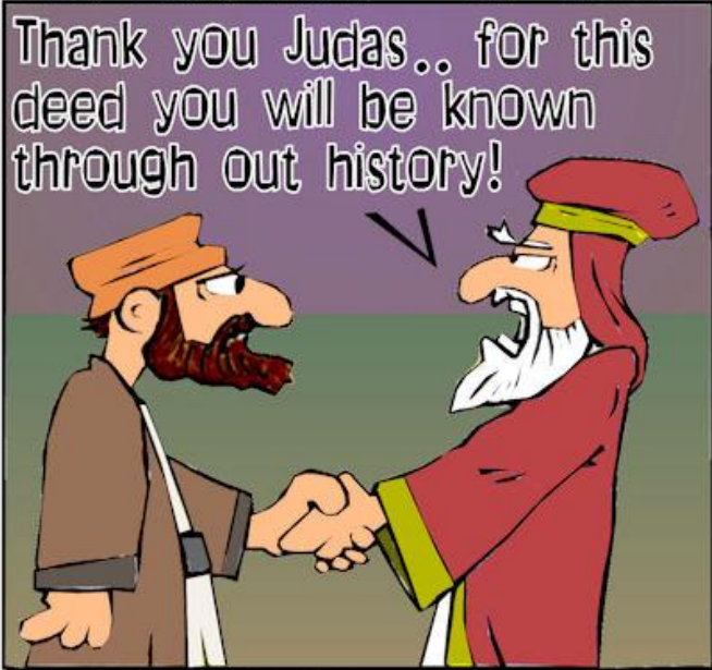
THE PRICE OF BETRAYAL .. 30 Pieces of silver bought Judas.. INFAMY! Mt. 26:15, Mk 14:10-11