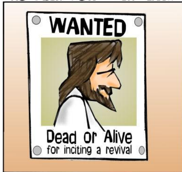
Jesus stirred such angst within the Jewish community that his profile was found in all the postal offices in the land. Mk 3:6, Mt 26:4