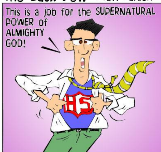
Mild mannered Joe Christian knows that when trouble arises.. THERE'S NO NEED TO FEAR.. The HOLY SPIRIT OF GOD is here! Ro 8:26-27