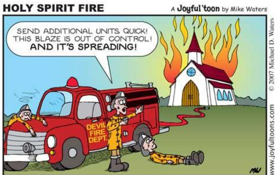
They saw what seemed to be tongues of fire that separated and came to rest on each of them. All of them were filled with the Holy Spirit... — ACTS 2:3-4 NIV